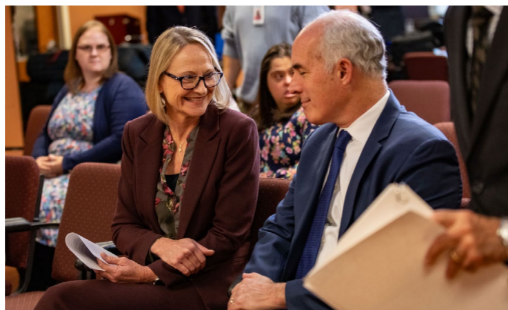
Image: State Treasurer Garrity and Senator Casey.

These accounts allow Pennsylvanians with disabilities and their families to save for disability-related expenses without risking essential benefits, creating pathways to greater financial security and independence.