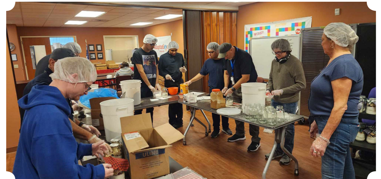
Image: LVCIL consumers creating T2L jars to sell at Christkindlmarkt

Thanks to crucial appropriation funding through Senator Bob Casey's office, T2L has been given a unique chance to grow more than ever. The program welcomed a dedicated Treats2Love Project Coordinator, enhancing our ability to support jar preparation, creation, and business development. This additional support has proven invaluable as T2L looks beyond seasonal sales toward year-round opportunities.