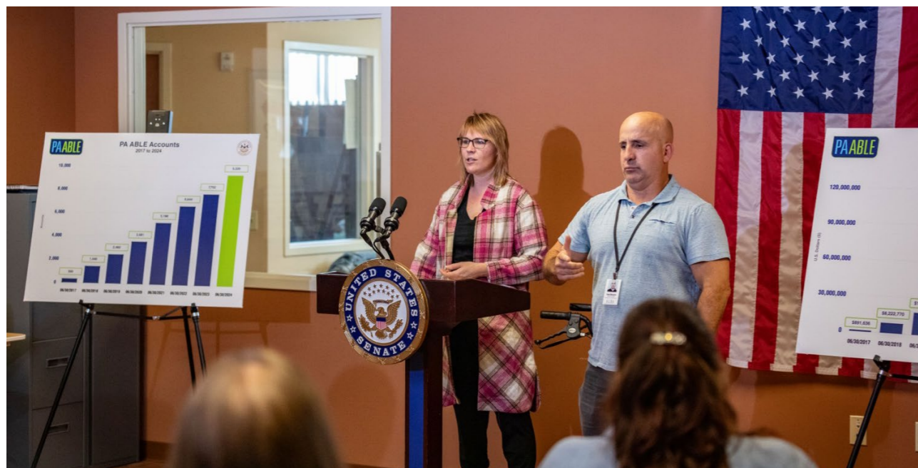
Image: A guest speaker (left) shares how the ABLE account will help her as a person with a disability. American sign language interpreter translates. (Right)