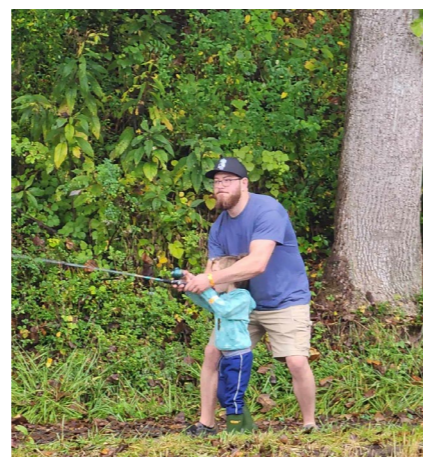
Image: A parent helping their young child reel in a fish on the banks of the river

Just on the banks of the Lehigh Parkway, LVCIL and the City of Allentown Department of Parks & Recreation brought the community together for a day of fun in the (not so sunny) park. Sponsored by IronPigs Charities, the event drew 100-150 community members, some seasoned anglers and outdoor adventurers, and some who learned how to cast their line for the first time!