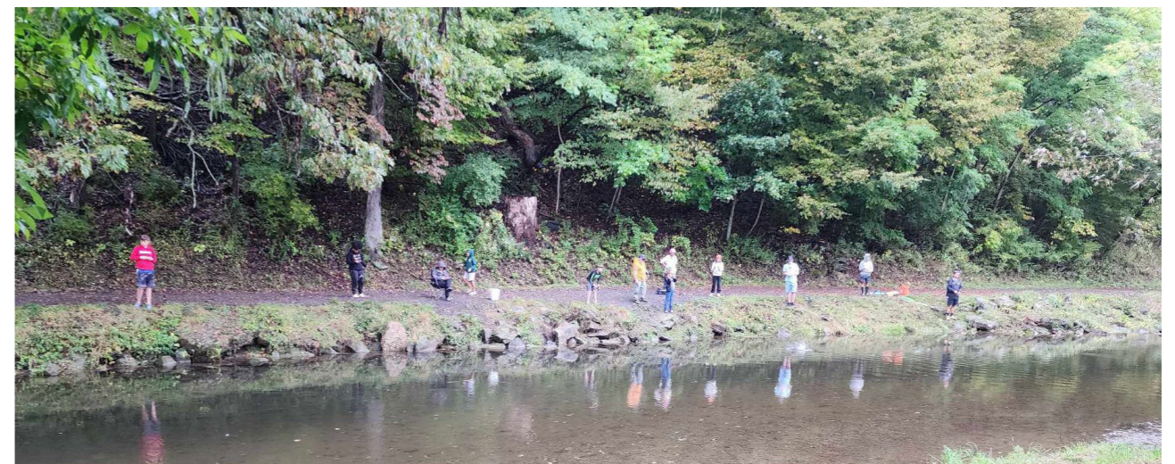
Image: Fishing and Fun participants on the riverside

As LVCIL and the City of Allentown look toward next year's event, plans are already forming to expand food vendor participation and extend planning timelines. However, the core mission remains unchanged: creating accessible, inclusive outdoor activities that strengthen our community bonds and introduce more families to the joys of outdoor recreation.